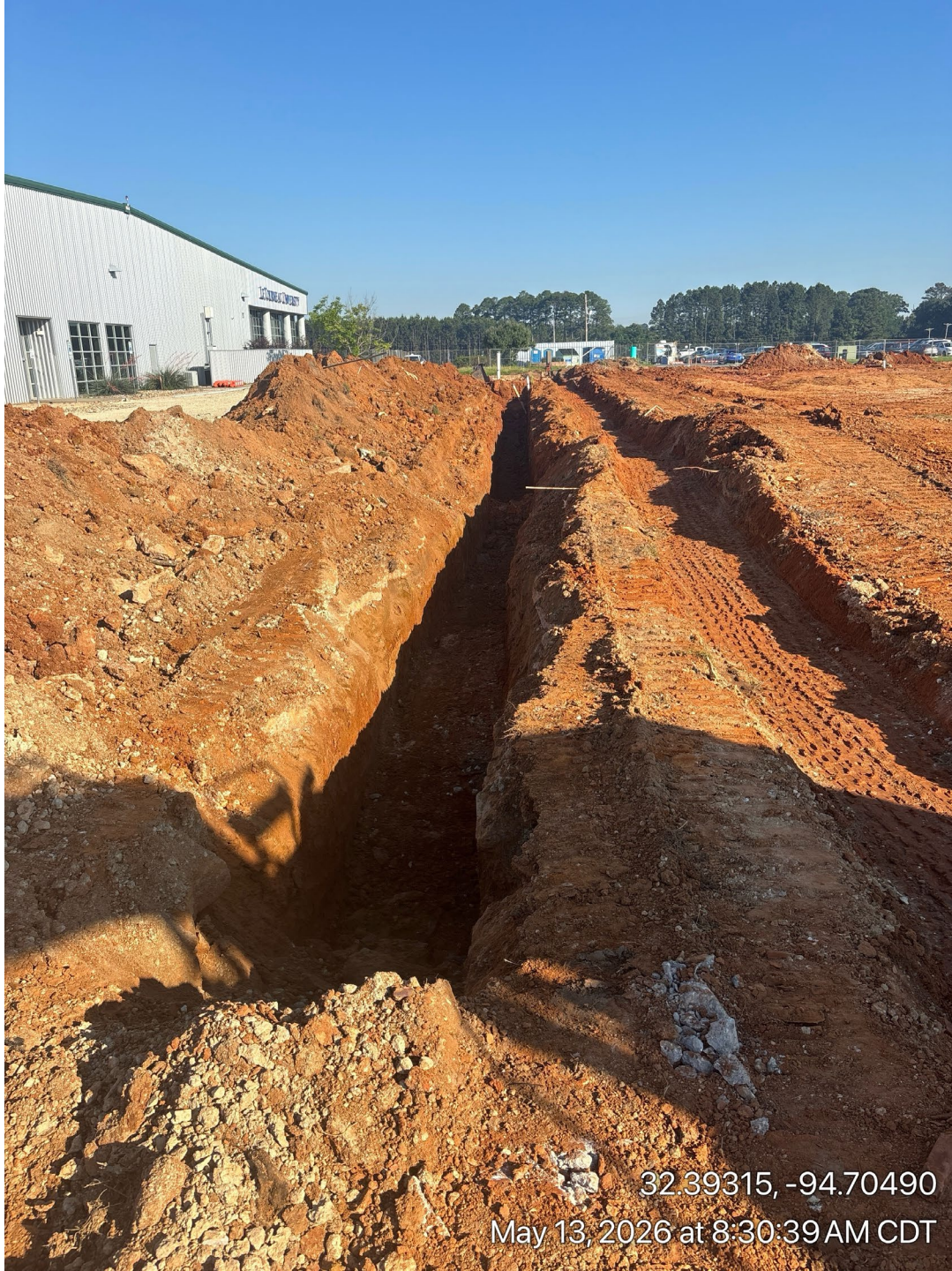
32.39315, -94.70490 May 13, 2026 at 8:30:39 AM CDT