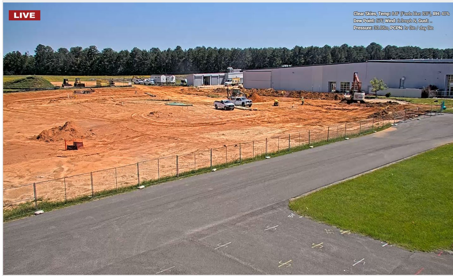
Site as Pictured 05.13.2026