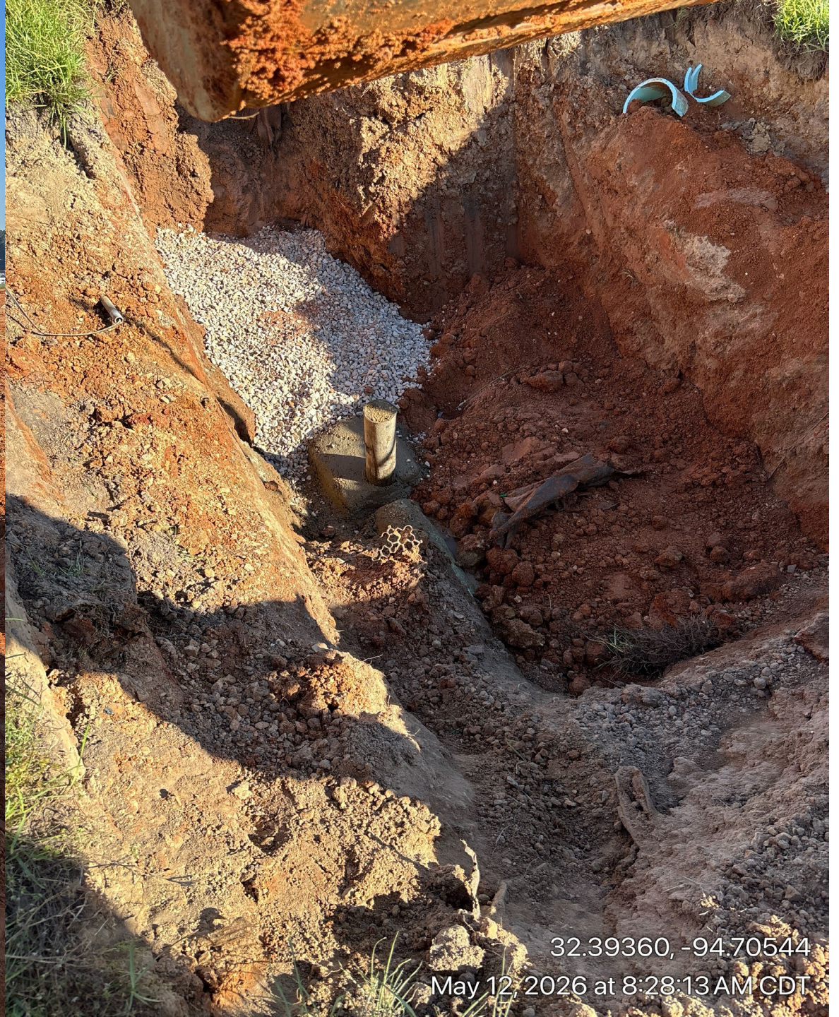
32.39360, -94.70544 May 12, 2026 at 8:28:13 AM CDT